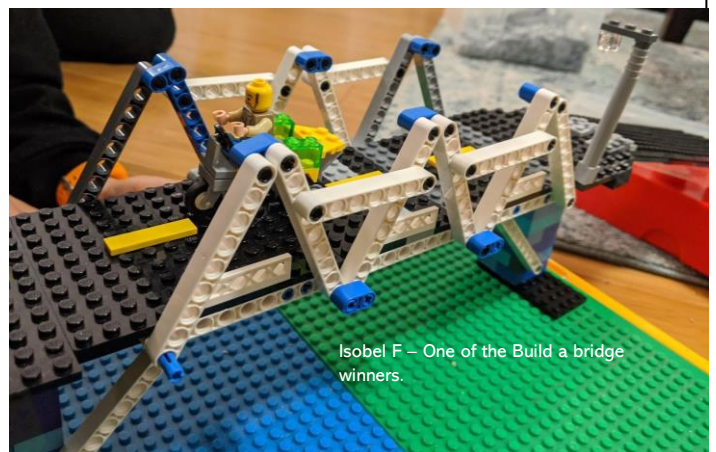
Isobel F – One of the Build a bridge winners.

There have already been two competitions, and another is due today, (make a house, make a bridge, and make a marble maze) and more challenges are yet to come!