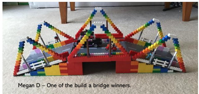
Megan D – One of the build a bridge winners.

There have already been two competitions, and another is due today, (make a house, make a bridge, and make a marble maze) and more challenges are yet to come!