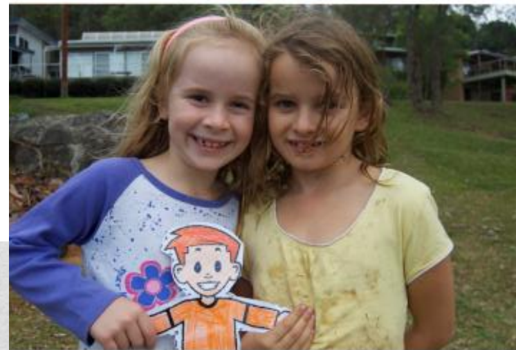
Flat Stanley with my friends at Bar Point