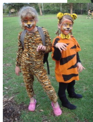
BPS Junior Drama Group and 'Year of the Tiger'

Music - Band - Thankyou to all the parents who helped with the Fair and also to the fantastic musicians who played so well on Saturday afternoon.