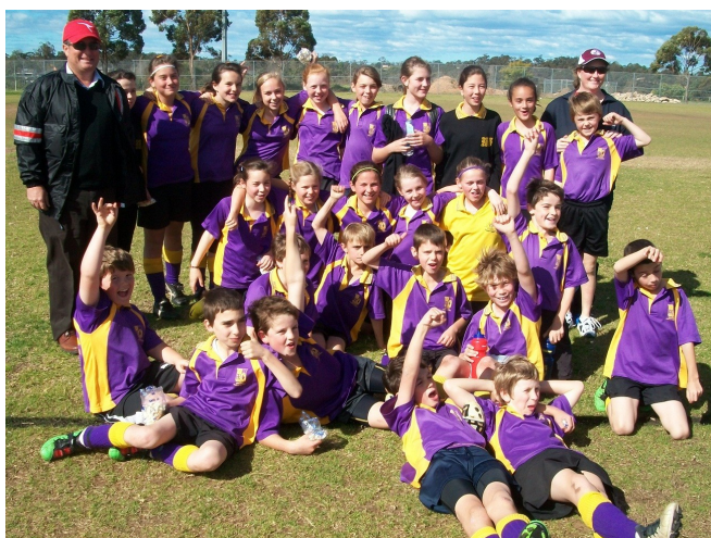
Our successful Girls team and Junior Boys team

Our whole team played really well and ended up winning the match 5-1. This result was a great way to finish the season. Our team can be very proud of this very successful season, in which we scored 53 goals and only conceded 2 in 10 games. This also marks the second year in a row that we have finished the competition undefeated. Let's hope it carries through this way again next year. Great effort girls.