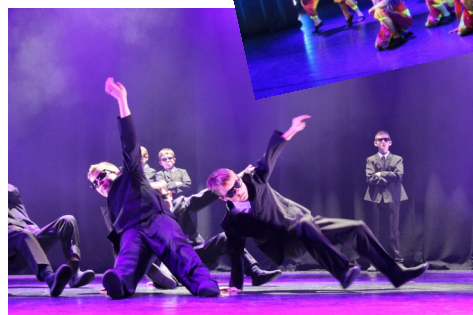
Girls and Boys Dance Groups at the recent Dance Festival at Glenn Street Theatre, Belrose