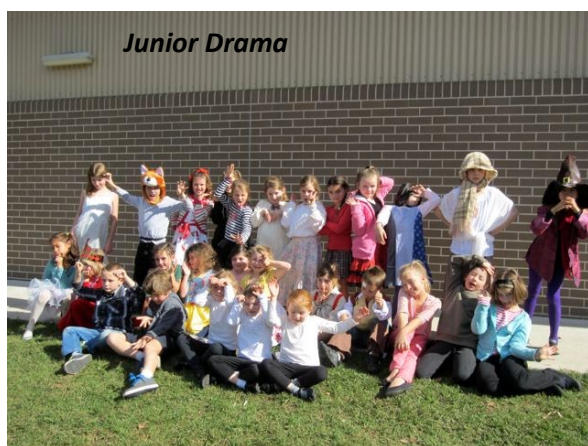
Drama groups at school after Dress Rehearsal.

Tired but happy performers who did an wonderful job at NIDA this year.