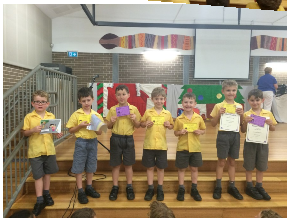
Our Merit Certificate recipients