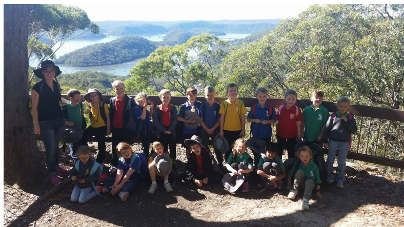
Year 2 at Muogamarra What a view!!

Have a read if you are interested.... http://qz.com/642351/is-the-way-we-parent-causing-a-mental-health-crisis-in-our-kids/