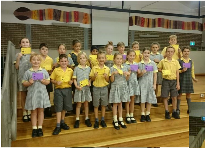
More Award Recipients