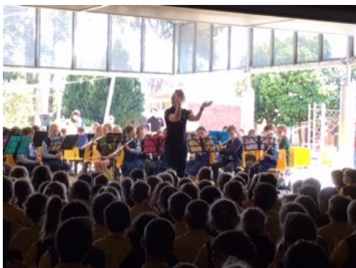
Berowra band tour last Thursday