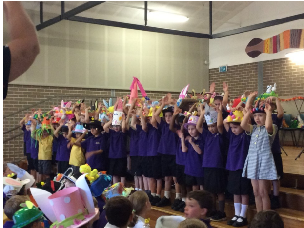
Thursday 29th March