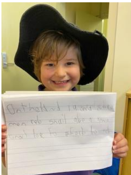
Students have been writing compound sentences by using connectives to join two simple sentences. They have also added adjectives to make their sentences more interesting.