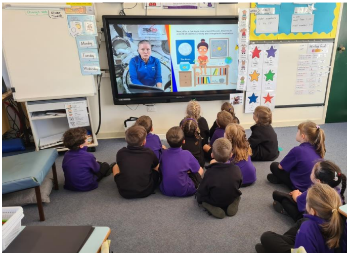
Our Kindy students....totally engaged while listening to Simultaneous Story Time.