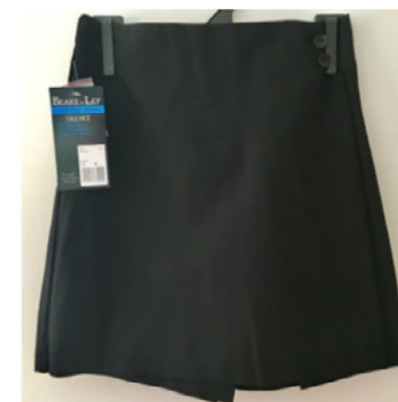
Girls black skort