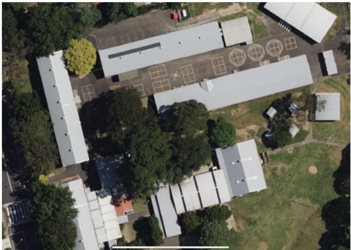
The 1952 building from the air today.