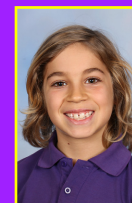
Caidan A 5/6G